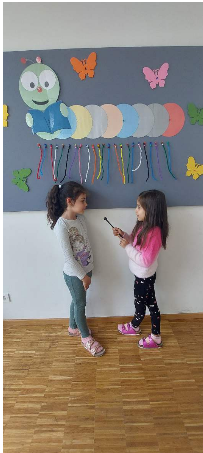
PYP 1 Hasanović class interviewing each other to find similarities and differences in each other.

The second grade is focusing on building communities. They have identified key essential agreements for making a community function. The students selected their essential agreements for their classroom so that they can all share the responsibility of making their classroom a safe, growing place for everyone who enters.