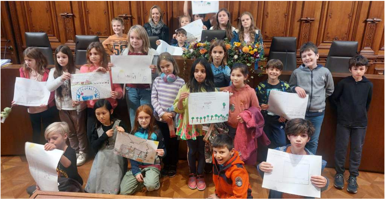
PYP 4 Edler at the Mayor Kahr's Office